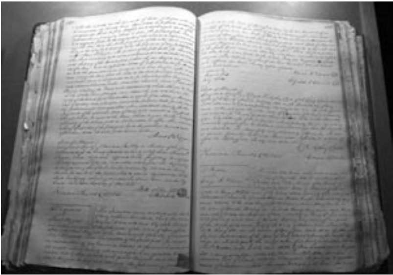
Figure 1. Mary Todd and her sister Frances witnessed an 1835 sales transaction recorded in Sangamon County Record Book H. The entry places the Todd sisters in Springfield two years earlier than previously thought.

wardses, who were still establishing themselves in Springfield. Although Ninian Wirt Edwards was the son of Ninian Edwards—Illinois territorial governor and one of Illinois' first senators after statehood in 1818 and its third governor—he had yet to make his mark in the world. He attended Transylvania University in Lexington, Kentucky, where he courted and married Elizabeth Todd, daughter of wealthy businessman Robert Smith Todd on February 29, 1832. Graduating the following year, Edwards took his bride to Springfield where he began the practice of law. In 1834, Governor John Reynolds appointed Edwards to be Illinois attorney general, most likely as a favor to Ninian's illustrious father. Like his father, Ninian Wirt Edwards so conveyed an air of an aristocrat that fellow attorney Usher Linder recalled that Edwards "was naturally and constitutionally an aristocrat, and he hated democracy when I first knew him, as the devil is said to hate holy water." 3