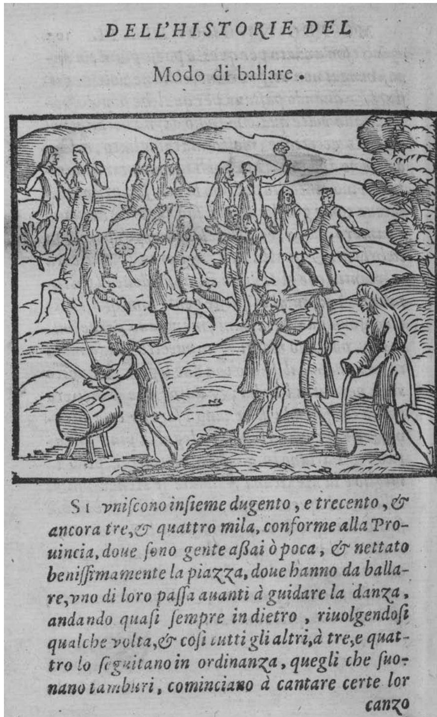
FIGURE 2: Girolamo Benzoni, La Historia del Mondo Nuovo (Venice, 1572), fol. 104v. This engraving, which also appeared in the 1565 edition, depicts Mayan revelers. Although disdainful to Benzoni, chocolate was integral to keeping the Mesoamerican celebrants awake for the nocturnal festivities. In the lower right corner, a figure froths the chocolate. Shelfmark: xE141.B42.