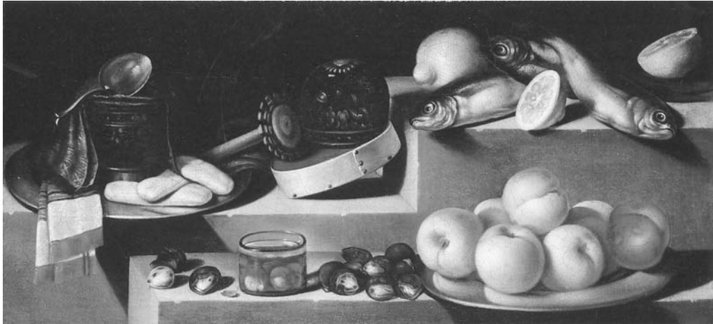
FIGURE 4: Antonio Ponce (1608–1677), A Still Life of Peaches, Fish, Chestnuts, a Tin Plate and Sweet Box and Two Mexican Lacquer Cups . In Spain, it became increasingly common by the late 1630s for still lifes to depict chocolate accoutrements. In this painting, chocolate is signified by the lacquered gourds known as jícaras and the molinillo used to froth chocolate (upper left), perched on a container holding ground cacao. The presence of the gourds and frother demonstrates that chocolate engaged Iberians’ tactile and visual senses in much the same way it did their Mesoamerican antecedents.

sufficient technical knowledge to warrant bringing the raw materials, so chocolate itself was transported. It was not until the 1630s that chocolate artisans populated Madrid in detectable numbers. 84 This trajectory makes clear that European chocolate was not just similar to American chocolate. It was American chocolate.