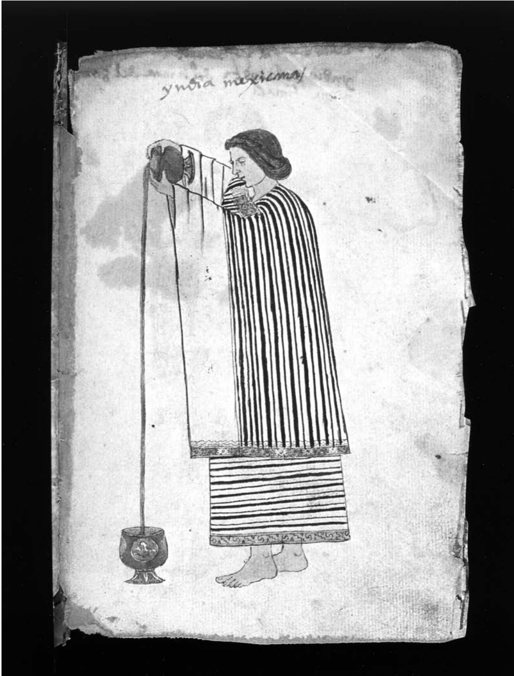
FIGURE 1: Codex Tudela , fol. 3r. From a manuscript painted in New Spain ca. 1553, this image depicts a Nahua woman, of high social rank (as suggested by her fine cloak), frothing chocolate by pouring it from a height. A similar representation of chocolate-frothing occurs on a ceramic piece used for serving chocolate by Maya from the Late Classic period (A.D. 600–900). 21 x 15.5 cm. Ink on vegetable-fiber paper.