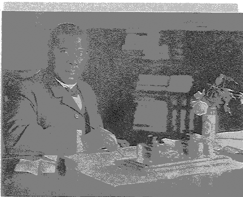
Booker T. Washington in his office.